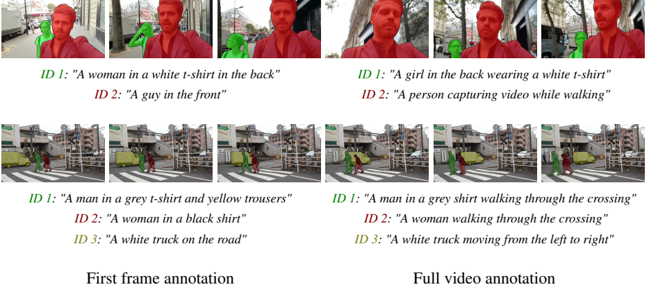
Figure 4: Example of collected annotations provided for the first frame (left) vs. the full video (right). Full video annotations include descriptions of activities and overall are more complex.