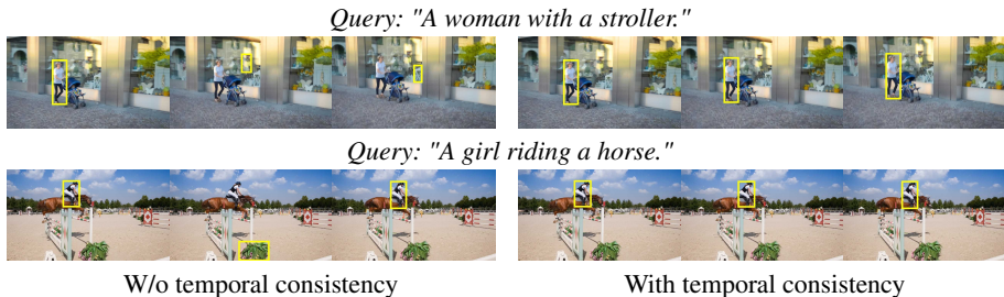
Figure 3: Qualitative results of referring expression comprehension with and w/o temporal consistency on DAVIS 17 . The results are obtained using MattNet [15] trained on RefCOCO [33].

for each frame and averaging the magnitude of the forward and backward flow. The obtained image is further scaled to [0; 255] to maintain the same range as RGB channels.