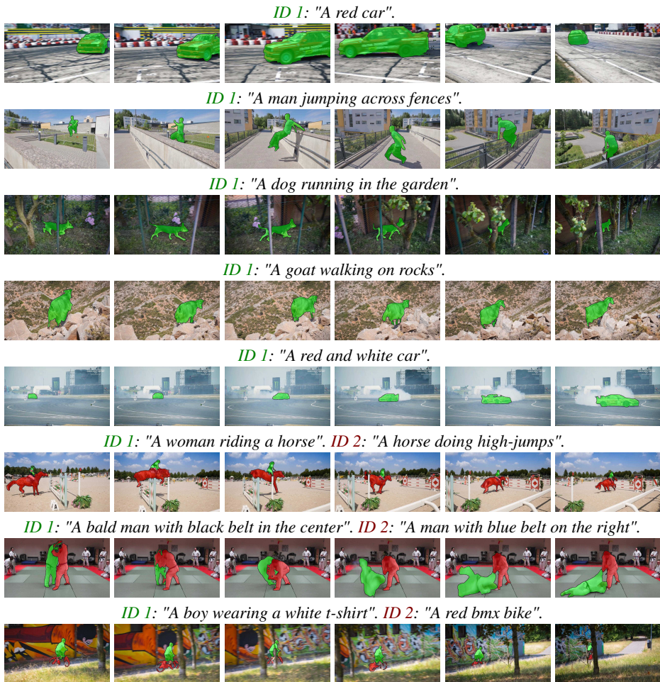
Figure 7: Video object segmentation qualitative results using only Language as supervision on DAVIS 16 and DAVIS 17 , val sets. Frames sampled along the video duration.

formance across different grounding models (for MattNet 35.4 \rightarrow 37.3 and for DBNet 32.6 \rightarrow 35.4).