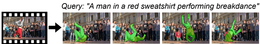
Figure 1: Examples of the proposed approach. Classical semi-supervised video object segmentation relies on an expensive pixel-level mask annotation of a target object in the first frame of a video. We explore a more natural and more practical way of pointing out a target object by providing a language referring expression.

Abstract Most state-of-the-art semi-supervised video object segmentation methods rely on a pixel-accurate mask of a target object provided for the first frame of a video. However, obtaining a detailed segmentation mask is expensive and time-consuming. In this work we explore an alternative way of identifying a target object, namely by employing language referring expressions. Besides being a more practical and natural way of pointing out a target object, using language specifications can help to avoid drift as well as make the system more robust to complex dynamics and appearance variations. Leveraging recent advances of language grounding models designed for images, we propose an approach to extend them to video data, ensuring temporally coherent predictions. To evaluate our approach we augment the popular video object segmentation benchmarks, DAVIS 16 and DAVIS 17 with language descriptions of target objects. We show that our approach performs on par with the methods which have access to a pixel-level mask of the target object on DAVIS 16 and is competitive to methods using scribbles on the challenging DAVIS 17 dataset.