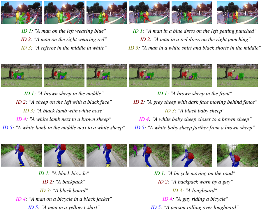
First frame annotation