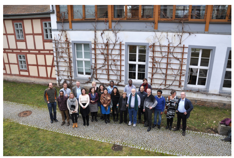
Participants at the Winter University in Neudietendorf.

The Winter University in Neudietendorf showed how the different projects of the PhD candidates interact with each other. Despite having different backgrounds and different research sites and topics, all of the graduate students address questions of the establishment, re-establishment, maintenance and alteration of social order. This common concern provided the basis for fruitful discussions during the Winter University. The main aim of this event was to reunite the students of the different MPIs, who had not met since 2015 (because REMEP lacked a coordinator during a transitional period).