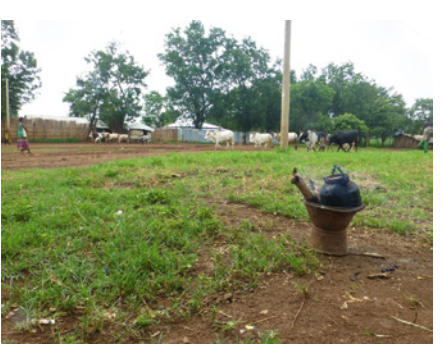
Anywaa village (left) and Highlander village (right) in Abobo.