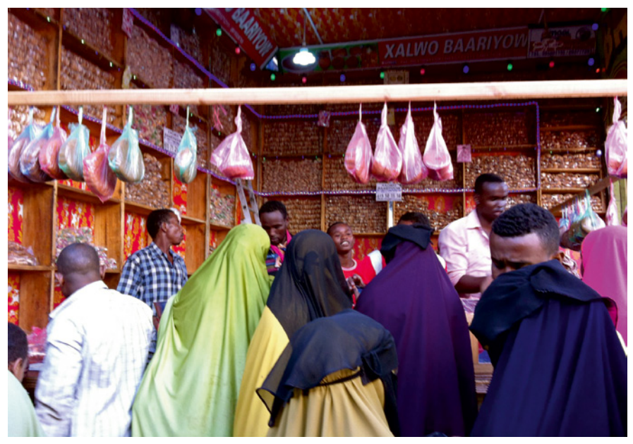
Candy shop in Bakaara Market, Mogadishu.

movement called the Khartoum School, which sought to buttress Sudan's distinctive identity as a newly independent nation by developing a new visual vocabulary. But since the installation of Omar al-Bashir's Islamist regime in 1989, and with the government's suppression of civil society and on-going ethnic conflict and violence across the country, artists' room for expression has become severely restricted. It has been further limited by the recent downturn of Sudan's economy, which has reduced support for the arts, among other things, and led many Sudanese youth to migrate abroad in search of employment and a better life.