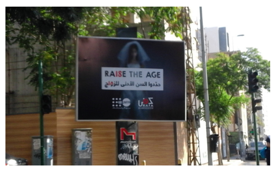
Poster for an ongoing campaign in Beirut against child marriage. Activists advocate women's rights and the protection of children, specifically, raising the minimum age of a woman at marriage to 18 – a law that should apply to all recognized religious groups in Lebanon.