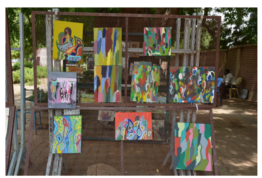
An open-air art gallery in Khartoum.