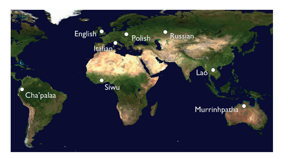
Figure 1. World map showing locations of data collection for the eight languages involved in the study.

understanding of the good, service or support received as part of a system of social rights and duties governing mutual assistance and collaboration.