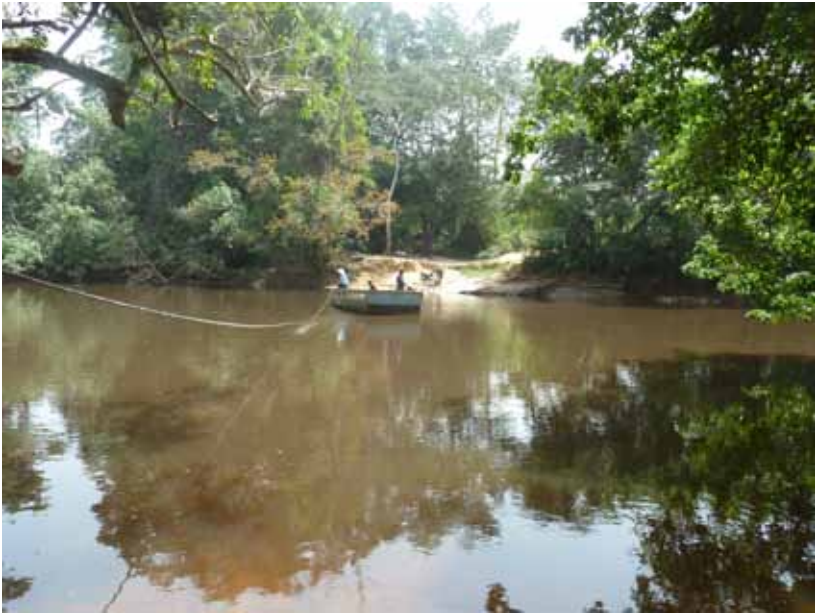
Photo 14: Nuon river and border crossing from Gborplay into Ivory Coast