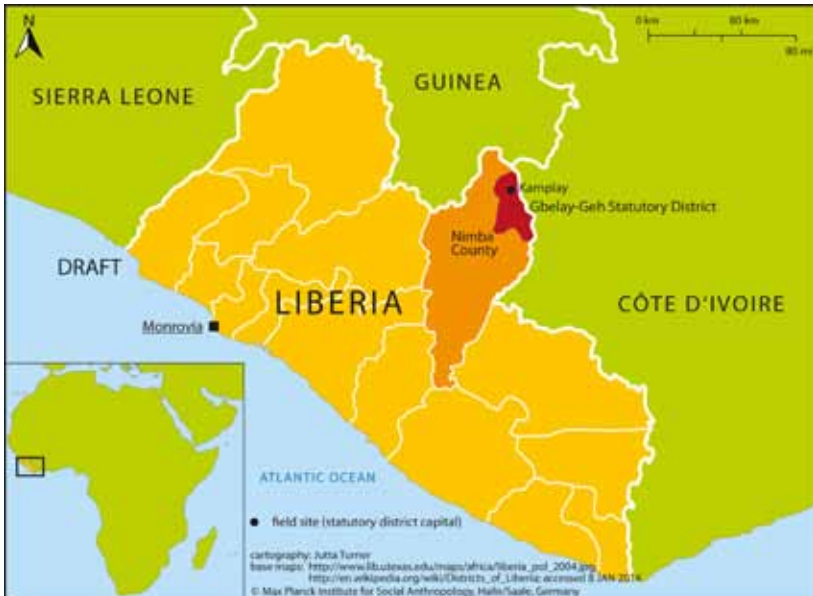
Map 1: Gbelay-Geh Statutory District within Nimba County, Liberia

For each of these settlements I provide the date the interview was conducted, the names of the elders who were present at the time of recording. This bullet-point overview is accompanied by a brief introduction in which I indicate the particular points of relevance of these narratives, in relation to their various angles of interest outlined in this general introduction.