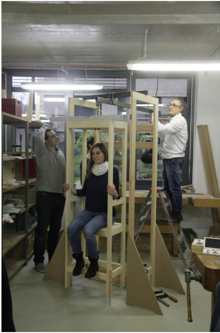
Fig. 4 The Adapted Reconstruction of the Sanctorian Chair.

torius's experiments ourselves, we aimed to develop a better understanding of their method. As the purpose and use of the weighing chair are closely connected to its design, these objectives could not be analyzed separately but had to be considered as complimentary to each other. In the following, I will give a brief overview of the two series of experiments and present the conclusions that we drew from them.