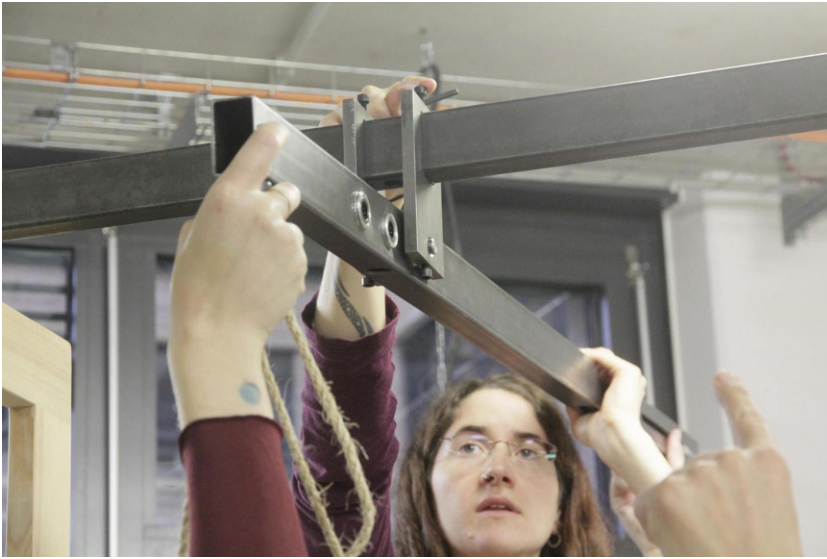
Fig. 6 The Ball Bearing to Minimize the Distance between the Pivot and the Lever.

precision of the weighing chair and on the other hand still allowed us to read the measurements at the bottom. We solved this problem with the modern solution of a ball bearing (see Fig. 6). Sanctorius, of course, had to find another method. The original illustration of the weighing chair shows that he connected the lever directly to the hook on the ceiling with some kind of box or rectangular guide, which made the distance between the pivot and the lever relatively small.