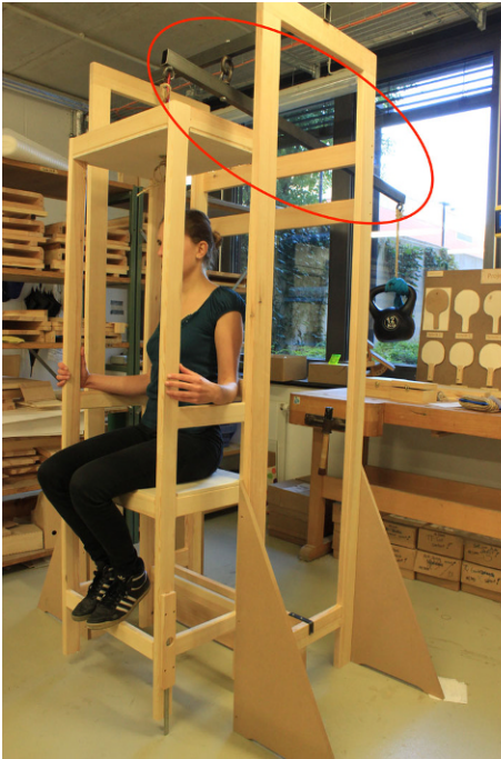
Fig. 2 The First Reconstruction of the Sanctorian Chair.

the metal workshop, we finished a prototype with which we could begin experimenting (see Fig. 2).