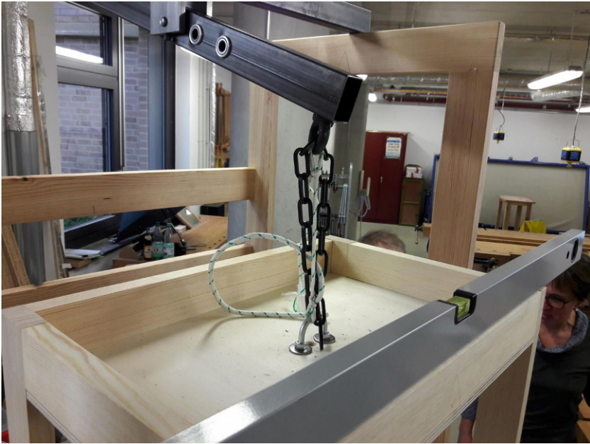
Fig. 5 The Suspension of the Chair.

it cannot be easily moved; [...] (Sanctorius 1625: 558)”. Unfortunately, he does not reveal to the reader how he achieved stability. Thus, we can only speculate that he might have used the pegs that we identified at each chair leg for stabilization. Arranged between the wood panel behind the chair and a platform holding the dining table, the pegs might have served as guidance to keep the chair as steady as possible. Based on these considerations, the idea evolved to add stable guides to the chair legs, which we plan to implement in a future version of our reconstruction.