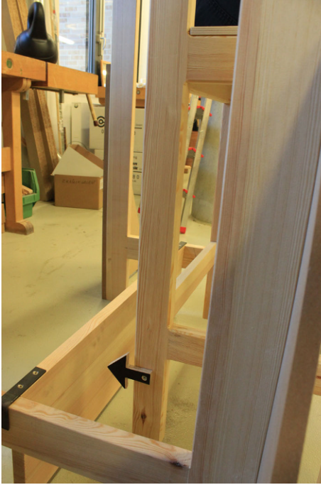
Fig. 7 Wooden Arrow as Indicator for the Descent of the Weighing Chair.

spective starting points of the varying persons using the chair. This was relatively easy and only became difficult when we tried to discern differences in weight. Calibration of the longer arm requires skill and great accuracy. Since we worked with a counterweight of 20 kg, it was extremely difficult to record minor weight differences, which corresponded to only very short lengths of the beam. Sanctorius probably did not face these problems as we can assume that he worked with a calibrated steelyard, which were used widely at the time.