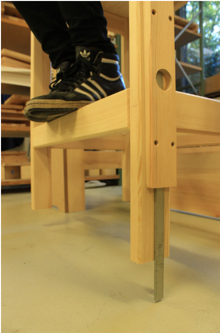
Fig. 8 Steel Bar as Indicator for the Descent of the Weighing Chair.

chair was problematic. We applied reference points to the wood panel to which the arrow points, but reading the measurements this way was very difficult. Even though we had already enhanced the stability of the chair in our second prototype, the person seated on the chair still had to remain in a very stable, balanced position to prevent the chair from descending more on one side than on the other. For every measurement, the distribution of the load on the chair had to be identical. The steel bar is far easier to handle and allows a very exact reading of the measurements. As the figure indicates, a graded scale is still missing. However, we plan to exchange the bar with a steel ruler in a future version of the reconstruction.