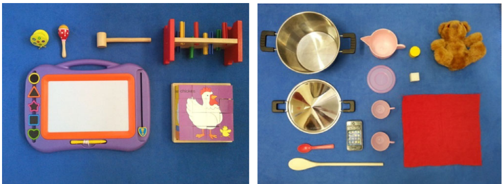
Figure 1. Functional (left) and symbolic (right) condition toys.

As a manipulation check, infant–caregiver interactions were first assessed for the level of symbolic play in both play conditions. The highest level of play of both caregivers and infants was recorded using the Pretend Play Observation Scale (Brown et al. , 2001; see Appendix). The reliability of coding was high: 12 of 54 (22%) of play sessions were coded independently by two coders, who reached 92% agreement. The symbolic play condition had significantly higher levels of symbolic play than the functional play condition for both