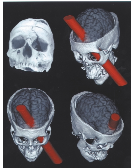
Fig. 1. Reconstruction of the lesion incurred by Phineas Gage, in which an iron bar was driven through his prefrontal cortex as a result of a blasting accident.

Patients with early-acquired OFC damage 2 are remarkably similar to those with adult-acquired damage in that they display profound and pervasive difficulties in social behavior despite intact intellectual abilities. These adjustment problems were obvious from an early age. However, their problems include stealing and violence to persons, which the authors report is not characteristic of