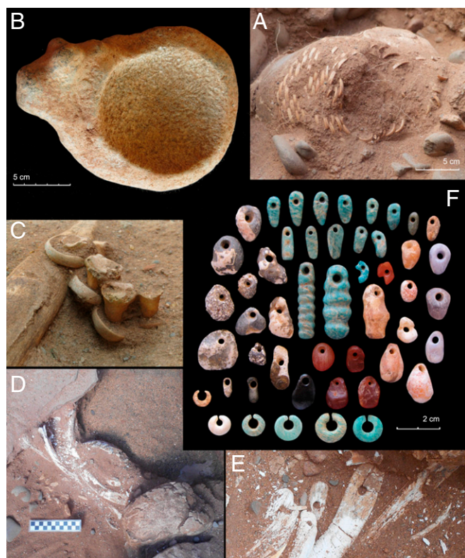
Fig. 3. Ornaments and palette recovered from mortuary contexts at Lothagam North. Counterclockwise from upper right. (A) Remnant of headpiece with latticed arrangement of teeth (incisors) from gerbils (cf. Gerbilliscus ); portions of the individual's cranium are visible to the left and upper right of the headpiece. (B) Stone palette with zoomorphic bovine carving. (C) Human finger bones with ivory rings still in place. (D) Cluster of perforated hippo tusks adjacent to cranium of primary burial. Additional secondary human remains, a caprine calcaneus, and the stone palette were found below the scale marker. (E) Detail of hippo tusk perforation; the largest tusk is ~3 cm wide. (F) Sample of stone and mineral bead pendants and earrings. Pictured materials include amazonite, fluorite, zeolite, talc, hematite, and chalcedony; specific material identifications are given in SI Appendix, Fig. S5 .

extended areas, or even fostered networks for long-distance exchange or risk sharing. The need to actively propagate such social connections would be strongest during initial stages of the moving frontier and dramatic environmental shifts (39), waning after herding became entrenched into a “static frontier” with routine networks of interaction, and once rainfall and shorelines stabilized at lower levels. The chronology of pillar site construction and closure matches these expectations, suggesting that monumentality around Lake Turkana helped mitigate social and economic uncertainties in a frontier situation.