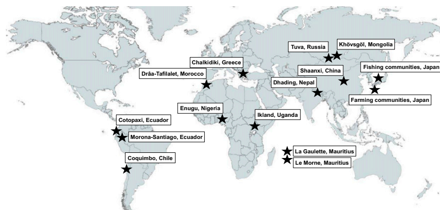
Fig. 1. Map of the 15 field sites.

Between-Community Results. The shame system evolved for making decisions in—and tracking the values of—one's local group (13; see also ref. 63), and so cultures could potentially differ from each other to an arbitrarily large degree in what is shameful and devalued. Indeed, some actions, traits, and situations elicit devaluation in some cultures but not others (13, 64). Furthermore, a rich literature in anthropology and cultural psychology exists on cultural differences in emotion, although this work seldom addresses cross-cultural similarities or questions of functional