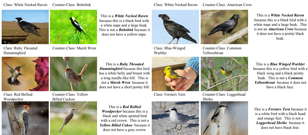
Figure 2. Qualitative examples of counterfactual explanations. Image on the left, with example image from counter-class on the right. We show the explanation from (Hendricks et al., 2016) followed by our generated counterfactual explanation.

be applied to the example bird from the counter-class “Common Yellowthroat”. However, when including the counterfactual explanation generated by the method described in this work (“This is not a Common Yellowthroat because it does not have a black face.”), it is immediately clear that the bird on the left must be a “Blue-Winged Warbler” and the bird on the right is a “Common Yellowthroat.” Yellow faces on yellow birds are common, so it is likely that models which just discuss discriminative features in an image do not learn to mention yellow faces on yellow birds. In this case, the absence of a feature (“black face”) is helpful when explaining the bird category.