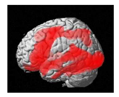
Figure 1. Sentence comprehension versus visual fixation.

Participants classified 94% of the correct sentences as acceptable and for the sentences that contained syntactic or semantic anomalies the results were as follows: For sentences with a syntactic violation, 98% was rated as unacceptable, for semantic anomalous sentences, 81% was rated as unacceptable, and the sentences with combined violations, 99% were rated as unacceptable. One sample t-tests, comparing classification performance to 100% for each sentence type were all non-significant.