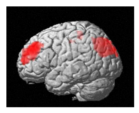
Figure 4. The main effect of syntactic anomaly.

The main effect of syntactically correct sentences ([SE+CR] > [CB+SY]; Figure 3), showed significant activation in the inferior frontal cortex (BA 6/44/45/47; P < .001, FWE; left > right), including the mid-anterior insula extending into the