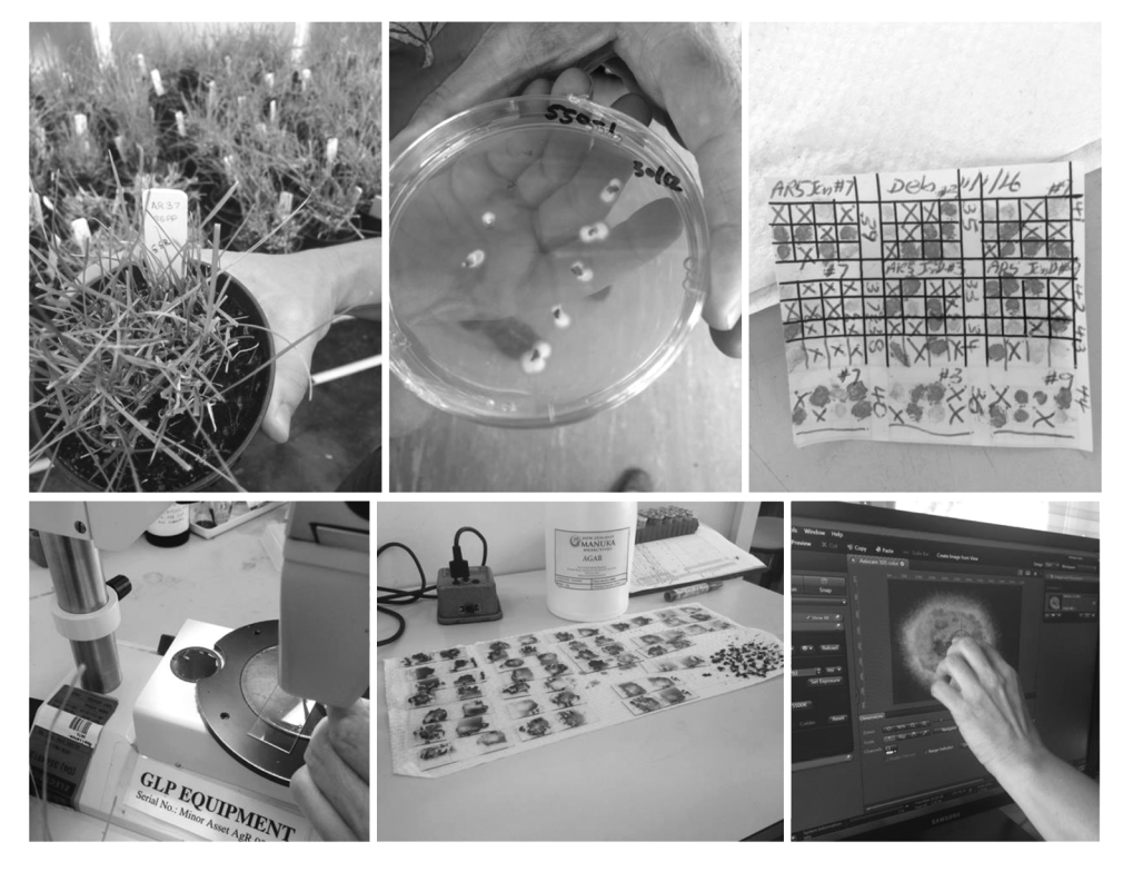
Figure 1. Immunoblot: red chromogen-bound tiller imprints from endophyte-infected plants and unbound imprints from endophyte-free plants (top, left to right); aniline blue stain of infected seedlings using microscopy (bottom, left to right); magnification of fungal endophyte culture, Ag-Research, Palmerston North, New Zealand.

detail below.<sup>62</sup> The seeds collected in the field reach the gene bank in their paper packets, notated with accession number and species-subspecies. Gene bank managers import or key in data from spreadsheets collated in the field, including GPS coordinates, site data, and individual notes on the plant encompassing maturity, habitat, and unusual phenotypic characteristics. While the majority of collected specimens are logged in the Margot Forde Germplasm Centre database, repackaged, and transferred to cold storage vaults, a minority are selected for the working material of the cereal endophyte researchers. These are grown out as seedlings in containment glasshouses, where they are inspected by the MPI for pests and diseases and subjected to further examination.