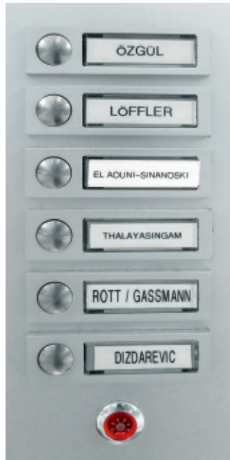
Frankfurt is a global city, home to people from 176 nations. Their countries of origin are as diverse as those, for example, of the population of London.

by side with one another no longer fits with the social conditions he has encountered – and not just in Frankfurt. As a social anthropologist for more than two decades now, he has been studying the phenomena of international migration, cosmopolitanism and multiculturalism in the major cities of the world.