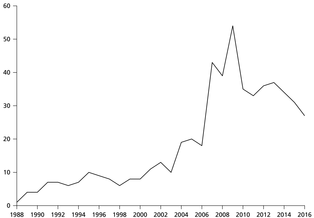
Figure 4 Journal articles on “social Europe,” “European social model,” “European social policy,” “social dimension”