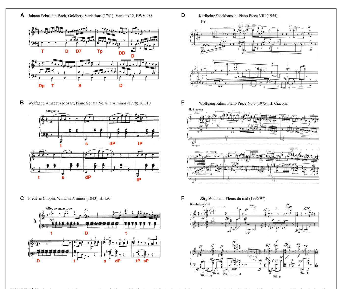
FIGURE 1 | Single piece analysis by means of music theory. Metrical regularity in classical pieces is readable in the strictly kept time signature at the beginning, the equal lengths of tones and the repetitive accompaniment in (B,C) . In contrast, atonal pieces (D-F) show different time signatures and a large variety of note lengths, resulting in a complex rhythm without a regular meter. Tonality in the classical pieces is indicated by the set-up of the home key in the beginning. In (A) the key of G major is prevalent in the first bar, being presented in a scale, supported by the G in the bassline. In the next bar the key switches to the dominant, D major , supported by the third ( F (#) in the bassline. In (B,C) , which reveals a homophonic texture (in contrast to a polyphonic texture in A) , the clear key structure is conveyed mainly by the chordal accompaniment, where each chord belongs to a particular function within the home key. The piece in (C) starts with the tonic ('t', A minor , 1st bar), followed by the subdominant ('s', D minor , 2nd bar), followed by the parallel of the dominant (dP) G major with a seventh, which leads to C major , the major parallel key of A minor ('tP'). This tonal structure is then repeated. In contrast, the atonal pieces reveal a completely different texture, leading to a more flexible structure that is first of all lacking triad-building chords. However, the chords that appear are highly dissonant. This becomes clear with looking at intervals. The first interval of (D) displays a G# , A and a F# in parallel leading to a highly dissonant sound especially due to the second. The third sound of (E) consists of six notes in parallel, similarly dissonant, again partly due to a minor second between E and F . Moreover, also consequent intervals suggest a dissonant, thus atonal structure. For instance in (F) the second bar consists of a ninth, 2 minor sevenths, 1 major seventh and a tritone, thus covering most dissonant intervals.

this contrapuntal piece consists of different, independent voices, intertwined with each other (as compared to homophony where one main voice is accompanied by a mainly chordal baseline, as is the case in Figures 1B,C ). Due to the specific implementation of key clarity in the MIR Toolbox (see description above) a swiftly moving diatonic melody (in the given 5 s window) as can be found in the Bach piece will result in more saturated pitch class