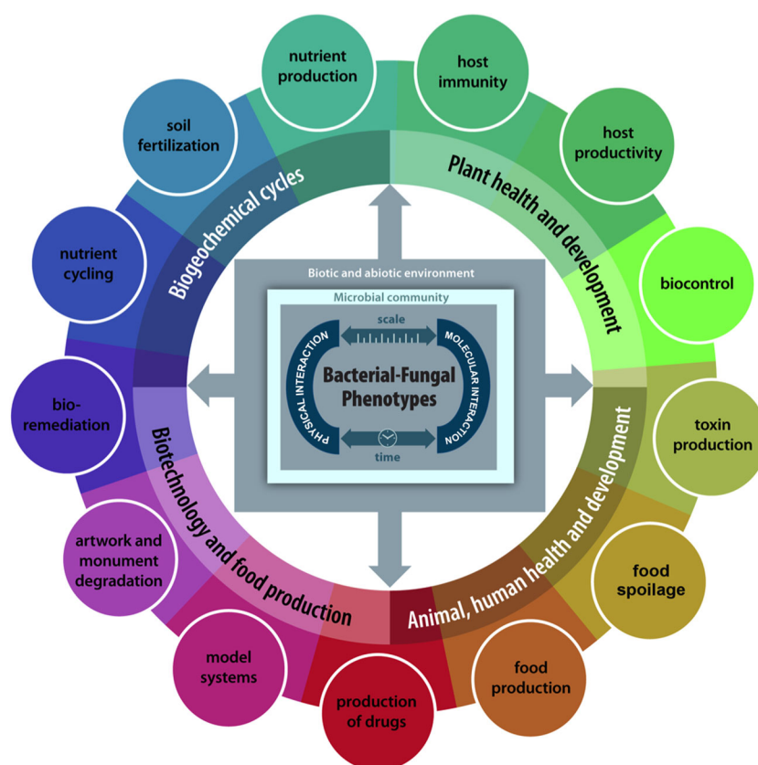
Figure 1. Relevance, applications and drivers of BFI. Biotic and abiotic environments filter microbial communities selecting for specific consortia, and conversely interactions between microorganisms influence the biotic and abiotic environment. Bacterial-fungal phenotypes emerge from physical and molecular interactions between members of the microbial community and are highly dependent on time and scale.