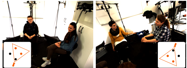
Figure 1: Illustration of the recording setup of the MPI-IGroupInteraction dataset [19]. The selected view and corresponding visible participants are shown in orange.

Specifically, emergent leadership detection in small groups of unaugmented people has only been investigated separately on two