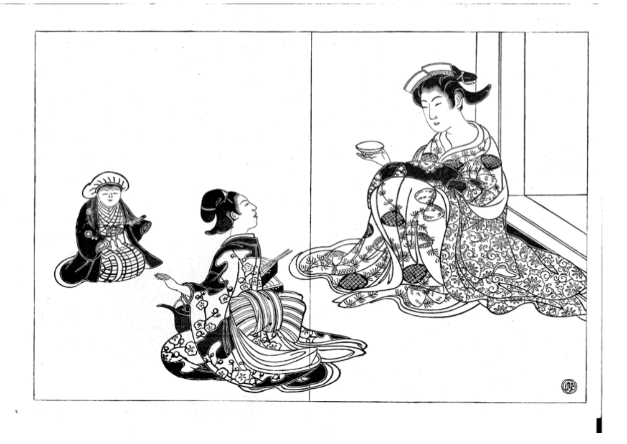
Fig. 2: "Two women and a child." By Harunobu 春信? Wood-block print, no date. Paper, ink. Author's collection.