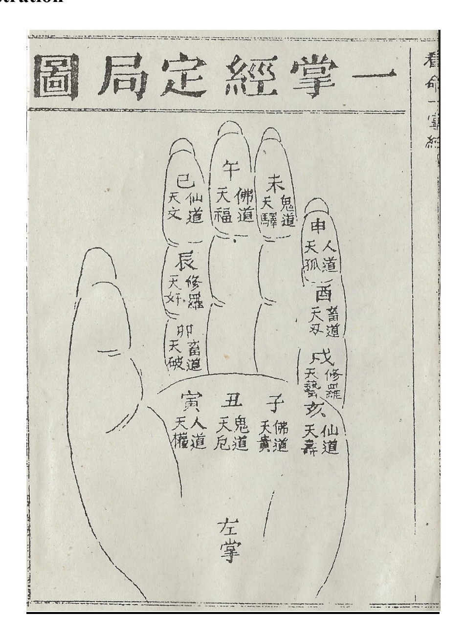
Fig. 4: Hand diagram excerpted from a recent edition of Damo yizhangjin 達摩一掌金 (Bodhidharma's Treasure of the Palm) attributed to Monk Yixing from the Tang dynasty (Yixing 釋一行. Kanming yizhangjing 看命一掌經 [Classic of Fate Auscultation in the Palm]. No place of publication: 2).