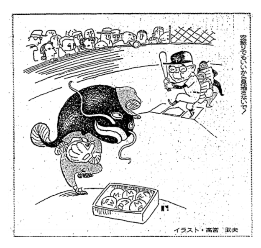
Fig. 6: Yomiuri shinbun, August 27, 1979: 25.

"Karaburi de mo ii kara, minogasanai de!"