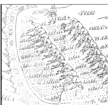
Fig. 5b: "Catching Immature Locusts" Chen Chongdi, 1874, unpaginated between 12b and 13a