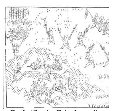
Fig. 5c: "Burning Flying Locusts" Chen Chongdi, 1874, unpaginated between 16b and 17a

The first stage of locust control in figure 5a requires deforestation, based on the traditional consensus among imperial commentators that locust eggs were originally fish or shrimp eggs laid among aquatic plants that could mutate into locust eggs when drought dried out watery margins just enough.<sup>10</sup> At stage two, locusts are literally combed crawling and hopping from the fields they have infested by regimented farmers (Fig. 5b). In the final stage, they are seen in flight from humans wielding branches trying to drive them into fire pits (Fig. 5c).