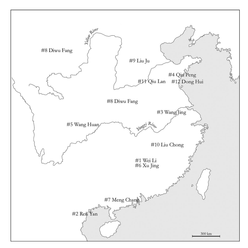
FIGURE 3. Spatial distribution of the benevolent officials according to the Hou Hanshu