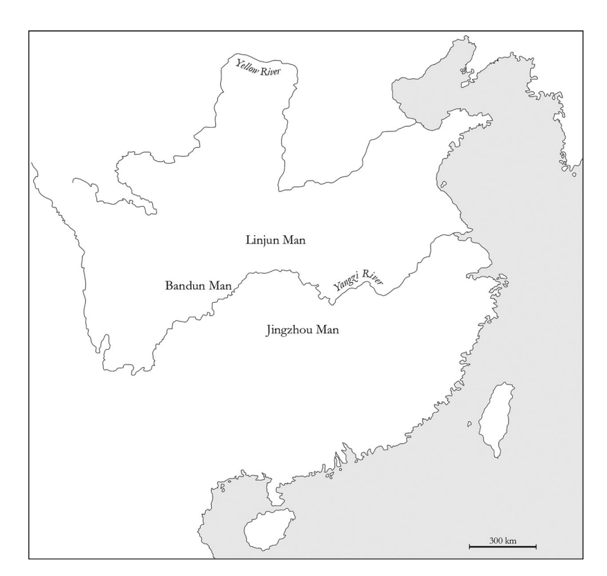
FIGURE 1. The inner Man according to the Hou Hanshu