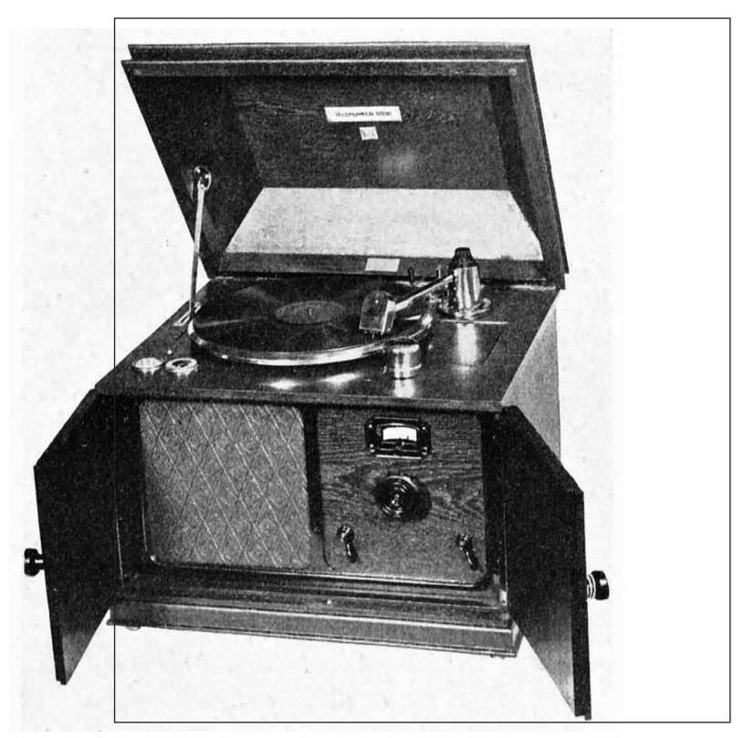
FIG. 1 "A playback machine with an electrical (sound amplification) box, con-nected with radio reception."

tutional setting that Doegen projected a vision of how the Lautabteilung could facilitate research within multiple disciplinary fields, but with atten-tion to broadcasting as one of the main tasks of its phonetic laboratory, in accordance with "scientific, pedagogical, or cultural concerns."<sup>17</sup>