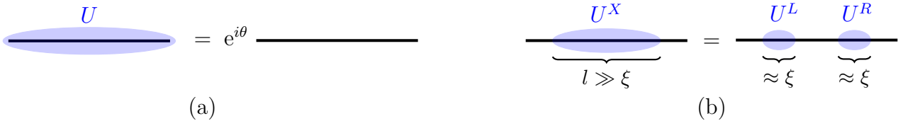
FIGURE 3. Consider a system which does not exhibit spontaneous symmetry breaking. (a) The ground state remains invariant when applying a global symmetry U = \prod_n U_n . (b) When acting with U^X on a line segment X of length l \gg \xi , then deep within that segment, the action is indistinguishable from the global symmetry operation U . Hence, the state can only be changed near the boundaries of X . In conclusion, effectively, U \approx U^L U^R .

symmetry fractionalisation and is the essential insight that led to the classification of (interacting) SPT phases in 1D [9, 11, 12, 59]. To illustrate this, consider the case with a symmetry group \mathbb{Z}_2 \times \mathbb{Z}_2 , generated by global on-site unitary symmetries U and V . Since U_n and V_n commute on every site, we have that U^X V = V U^X . Moreover, U^X = U^L U^R (when acting on the ground state subspace), implying that U^L and V have to commute up to a complex phase. Using that V^2 = 1 , we arrive at U^L V = (-1)^{\frac{\omega}{2}} V U^L where \omega \in \{0, 2\} . This defines a discrete invariant which allows to distinguish two symmetry-preserving phases. (One says that the phases are labelled by the inequivalent classes of projective representations of \mathbb{Z}_2 \times \mathbb{Z}_2 .) In fact, one can show that in the phase where \omega = 2 , the negative sign implies degeneracies both in the entanglement spectrum and, for open boundary conditions, in the energy spectrum [8]. Here we will not go into such details, referring the interested reader to the review in reference [40]. Instead, we consider the effect on correlation functions.