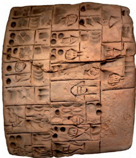
Figure 2.1: Proto-cuneiform tablet from Uruk (ca. 3 000 BCE) showing a calculation for the amounts of ingredients needed in the production of dry cereal products and beer. The transliteration is given below. See Nissen, Damerow, and Englund (1993, 42–43).

On Kushim’s tablet, five different numerical systems are used: one for cereal products, another for beer containers, and three different systems for the cereals themselves. In other words, the quantification of these objects was linked to their quality, while an abstract system of numbers designating quantity independent of quality and context did not yet exist. Similarly, the non-numerical signs used on these clay tablets were not elements of a writing system aiming at a rendition of human language, but just representations of certain administrative categories. We are thus confronted not with a primitive version of modern writing or mathematics, but with an evidently efficient administrative tool of the archaic Mesopotamian society, a symbolic system, and a way of thinking in its own right that is not reducible to our modern categories.