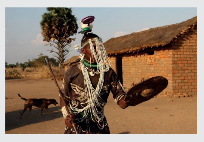
Figure 2. Lion dancer visiting a household.

In interviews in 2010, many householders conveyed dismay at this shift in Sukuma custom (Fitzherbert et al. 2014). Wafeki (Ki-Swinglish for "cheater" or "faker") had become a common epithet for men who hunt lions in a protected area and then dance as if they had provided a public good. Accordingly, a grassroots campaign, WASIMA (for Watu , Simba , na Mazingira ; in Kiswahili, "People, Lions, and the Environment") was established in 2011 to halt the prevalence and the spread of lion killing in Mpimbwe (Genda et al. 2012), a heavily human dominated landscape (Caro 1999).