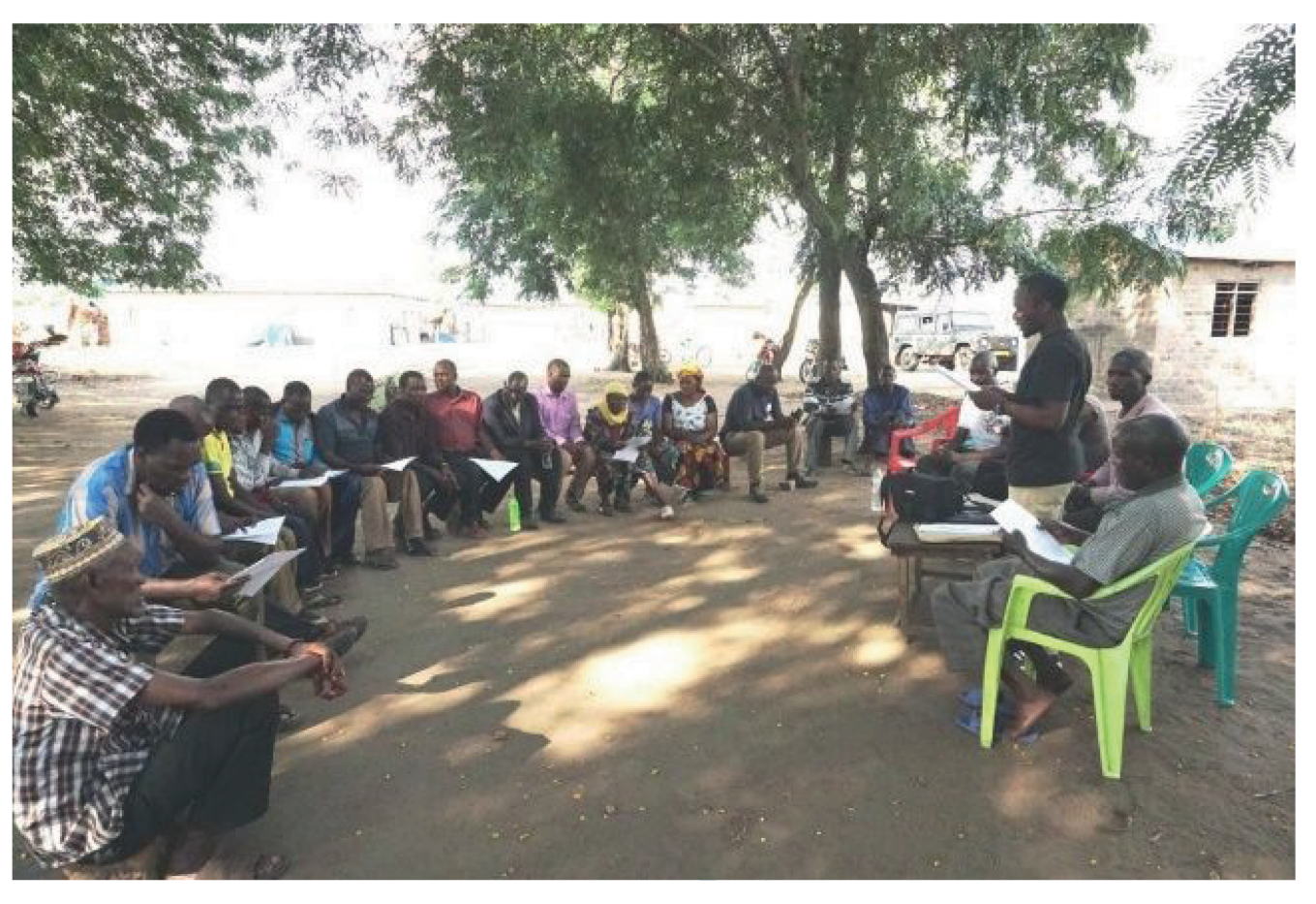
Figure 3. WASIMA staff facilitating a village council meeting in Mpimbwe.

which resulted in saving an estimated 29-38 individual lions between 2011 and 2016. These changes are coterminous with the establishment of the WASIMA campaign and likely contingent on the institution of bylaws and associated WASIMA activities. Because of both widespread internal migration of people across remoter areas of Tanzania (Salerno et al. 2014) and the continuing prevalence of human-lion conflict where (agro)pastoral populations live adjacent to protected areas (Salerno et al. 2017), these results are of considerable relevance to East Africa and beyond. We recognize the limitations of relying on reported data and of estimating demographic outcomes from lion dancer visits (both discussed below), but we use this apparent success story to reflect on the broader challenges and opportunities facing community organizations in evaluating their performance according to the metrics of international funders. These include the difficulty in counting lions saved; the tricky dynamics among the behavioral, attitudinal, and ecological impacts of their programs; and the challenge of convincing donors of the role of bylaws in institutionalizing conservation objectives.