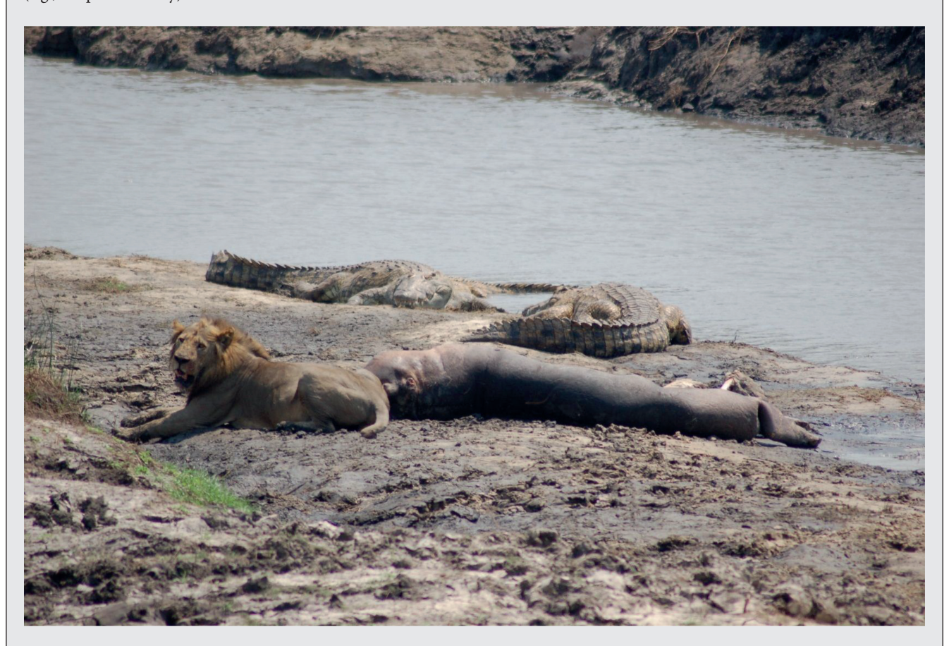
Figure 1. Male lion feasting of a dead hippopotamus in Katavi National Park with crocodiles in attendance.

Free-ranging African lions are perceived as problems by pastoralists (Woodroffe et al. 2005, Riggio et al. 2013) because lions threaten livestock and humans; indeed, predator depredation can amount to two-thirds of a household's annual cash income (e.g., Holmern et al. 2007). Consequently, killing lions in retaliation for livestock loss is commonplace in many parts of the lion's range (Ogada et al. 2003, Holmern et al. 2007, Hazzah et al. 2009, Dickman et al. 2014, Hazzah et al. 2017), and retaliators garner significant economic and cultural rewards among human populations that rely heavily on livestock (e.g., Fitzherbert et al. 2014). In the face of this human–lion conflict, various approaches encourage coexistence between people and predators (Dickman et al. 2011). These include compensation for livestock losses (Maclennan et al. 2009, Bauer et al. 2017), safer husbandry practices (Ogada et al. 2003, Kissui 2008, Lichtenfeld et al. 2014), individual lion protection (Hazzah et al. 2014), fencing (albeit contraversially; Packer et al. 2013), setting up community conservancies whereby income from tourism replaces that from livestock (Blackburn et al. 2016), and village bylaw implementation (e.g., the present study).