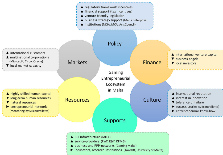
Figure 1. Entrepreneurial Ecosystem of the Gaming Industry in Malta (based on Isenberg, 2011).