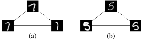
Figure 2: Examples of inconsistent edge labels produced by a stand alone Siamese network on the MNIST digits.

Approach II: Train the Siamese network and the CRF jointly. In this approach, we aim to train the Siamese network by taking the cycle consistency constraints into account. We resort to the proposed model, where we convert the partitioning problem to the energy minimization problem defined on the CRF (Eq. 5). Specifically, we add a stack of customized CRF layers that perform the iterative mean field updates with high-order potentials on top of the Siamese network (the customized CRF layers are introduced by [45] and the details will be described in Sec. 4.2). Now we are able to train the Siamese network and the CRF model jointly. As to the examples in Fig 2 (a), the probability of the top/right pair indicating the same digit is increased to 0.56, using the end-to-end learned Siamese network and it is further improved to 0.61 after the mean-field updates with the jointly learned CRF parameters. As to the overall performance, the accuracy of similarity measures produced directly by the Siamese network is increased from 91.5% to 93.2%. The corresponding final clustering accuracy is increased from 94.1% to 95.9%.