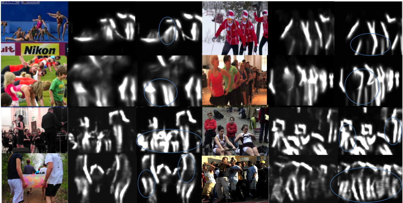
Figure 3: Feature learning comparison. Left: input image; Middle: part field map learned locally, without considering the cycle consistency; Right: part field map learned with the cycle consistency. The right samples clearly show sharper and more accurate confidence maps.