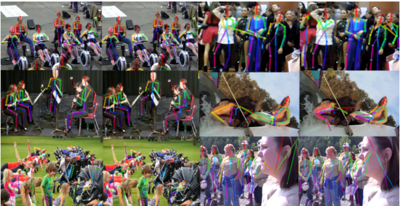
Figure 4: Qualitative Results. Left: association without CRF inference; Right: association after inference. First row , obvious wrong connections are corrected by inference. In the second row occluded people are separated. The samples in the last row are failure cases.