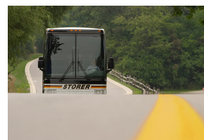
(b) Poor object detection

Detected visual objects: tv or monitor, cargo door, piano