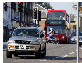
(a) Good object detection

Detected visual objects: traffic light, car, person, bicycle, bus, car, grille, radiator grille