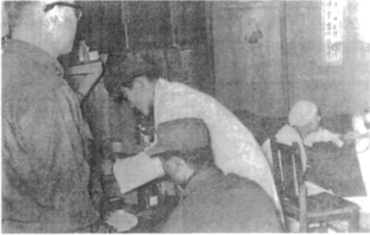
Figure 3. The Republic of Korea Army's Department of Blood Transfusion in 1953.

serological anthropology. First of all, since the closing of the Institute of Legal Medicine at Keijō Imperial University Medical School and the establishment of Seoul National University College of Medicine in 1946, there was no longer a research institute for serological anthropology in Korea. Furthermore, research at most medical schools was paralyzed by the political struggle between right and left (Kim 2015). With the scarcity of basic supplies in the aftermath of the Pacific war, blood-typing reagents were also in short supply nationwide (Kim et al. 1999). Lastly, the United States Army Military Government in Korea and later the South Korean government did not allocate much of their budget to basic scientific research. In the government's view, there was no reason to support a survey of blood group distribution in Korea. Instead, they committed to public hygiene programs like cholera prevention (DiMoia 2013). Under these circumstances, there were no medical scientists carrying out blood-group research, despite their knowledge of serological anthropology based on the biochemical race index.