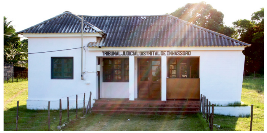
Court building in the town of Inhassoro, Northern Inhassoro province, Mozambique.