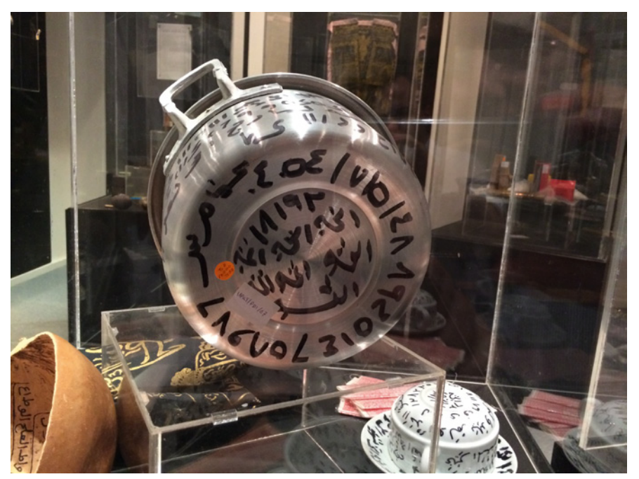
Confiscated 'magic' cooking pot. Picture taken at an educational exhibition of 'objects leading to religious deviation', sponsored by the Ministry of Religious Affairs, Brunei Darussalam.