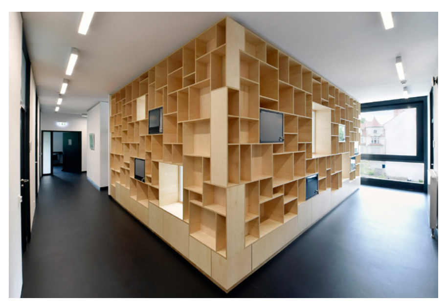
The new building for the Department 'Law & Anthropology', Max Planck Institute for Social Anthropology.

tions are clearly set out here, and it is already apparent that the various activities undertaken in conjunction with external partners considerably enhance the Department's scientific research programme – they allow for an expansion of the thematic range of the research being done and augment the interdisciplinary methodology that is at the heart of our work. This expansion of our activities has become all the more possible as our Department has been blessed, through the generosity of the Max Planck Society, with a brand new building in which to carry out our research activities. We moved into the building in December 2016 and officially inaugurated it with a gala celebration on 15 June 2017, in conjunction with the Department's 2017 annual conference, '(Re)designing justice for plural societies: accommodative practices put to the test'. I take it as a personal challenge to make sure that the Department fulfils its promise and lives up to the faith the Max Planck Society has put in us.