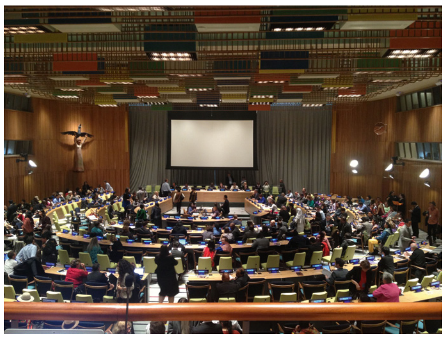
Annual session of the UN Permanent Forum on Indigenous Issues.