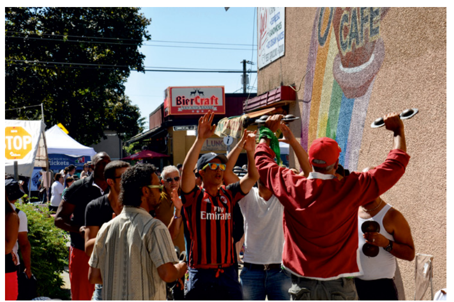
Moroccan drum session at Joey's Cafe on the occasion of 'Italian Day', Vancouver, 14 June 2015.

sustainability, human rights and gender equality to the country of origin; and negotiations regarding the care of and responsibility for remittances, inheritances, and other types of financial resources. A different strand of Turner's research employs the concept of 'supply-chain legal pluralism' (described below) to theorise the specific ways in which the mobility of people and goods interacts with flows of normativity. Yet another particularly interesting aspect of Turner's migration research is the mobility of religious experts who follow migrants and other mobile Moroccans to places in the global north.