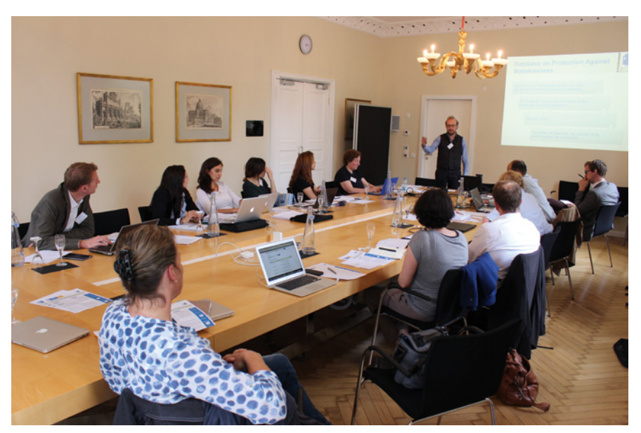
Meeting at the Harnack House in Berlin for the database of case law and legislation related to accommodating cultural diversity.

where anthropologists from around the world who are engaged in various ways in government service or consultancy work more generally can come to reflect on their own experiences. In doing so, Halle can serve as a prominent forum for the individual reflection and critical discussion that are at the core of anthropological practice today. thereby helping to define the role of legal anthropologists who do consultancy work. Issues concerning the purposes, dilemmas, vicissitudes and conflicts, as well as the empirical findings and the ethical problems raised by consultancy work, are bound to arise ever more frequently, thus obliging consultants to address these dilemmas and such questions as: What is the anthropologist's position in the societies he or she studies? Is he or she a relatively detached observer or someone committed to a programme of action to address the socio-legal problems studied? How is the anthropologist's study altered by his or her commitment? These questions – which revolve around the positionality of the ethnographic consultant – highlight the ethical questions at stake in the practical application of anthropological expertise. There is a clear need for further development of rigorous professional guidelines, and the Department will make a strong case for the elaboration of such guidelines.