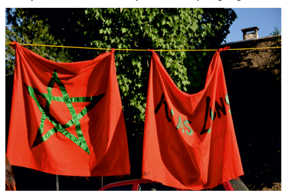
The Moroccan community proudly displaying the Moroccan national flag and another flag with the words 'Atlas Lions' – the name of the Moroccan national football team – on the occasion of 'Italian Day' in Vancouver, 14 June 2015.

This aspect of Turner's work has led to publications on theorising property anthropologically and – regarding Turner's research on Moroccan argan oil production - on dispossession in relation to resource extraction politics in which law and technology are co-constitutive and materialise in the deprivation of access rights for the local population. Turner details his approach to the anthropological theory of property in a contribution to the handbook Comparative Property Law (2017), which he undertook at the behest of Marie-Claire Foblets. His chapter serves as the point of departure for his further research and more concrete studies of property regimes. Today, new challenges to the range of property claims include tensions between public and open access, between alienability and non-alienability, and between ethically acceptable and no longer acceptable use. Turner argues that property regulation by means of law may profit from an anthropological analysis of 'property in context', especially if the focus is directed towards the effects such regulation may entail for the ways humans envision the future in times of highly uncertain and contested property regimes. From that point of view, an anthropological approach has the potential to enhance the stability and sustainability of legal regulation.