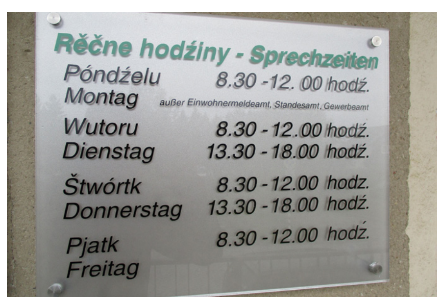
Bilingual sign in German and Sorbian at a local administration office in Lausitz, Germany.