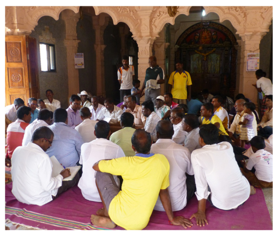
Meeting of a caste-based forum that carries out administrative and dispute-processing functions in the fishermen's village of Gonjhé.

On the basis of empirical data collected via the methods of participant observation and open-ended qualitative interviews, Kokal concludes that state law is translated through mechanisms of resistance and embracement, such as appropriation, adapta-