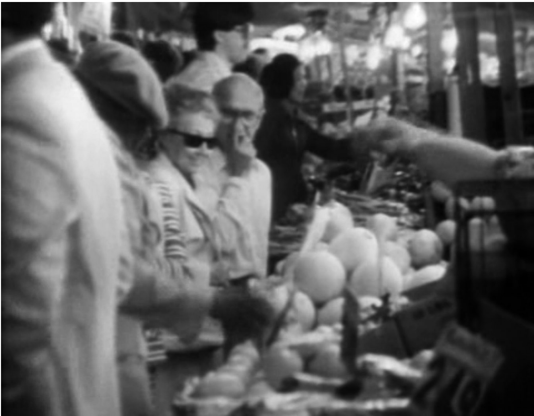
Street markets from episode 1 of Free to Choose