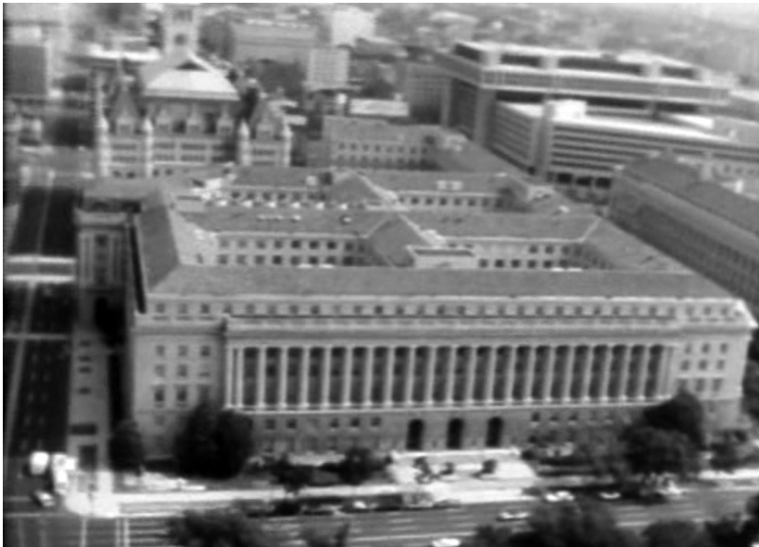
Massive government buildings in Free to Choose