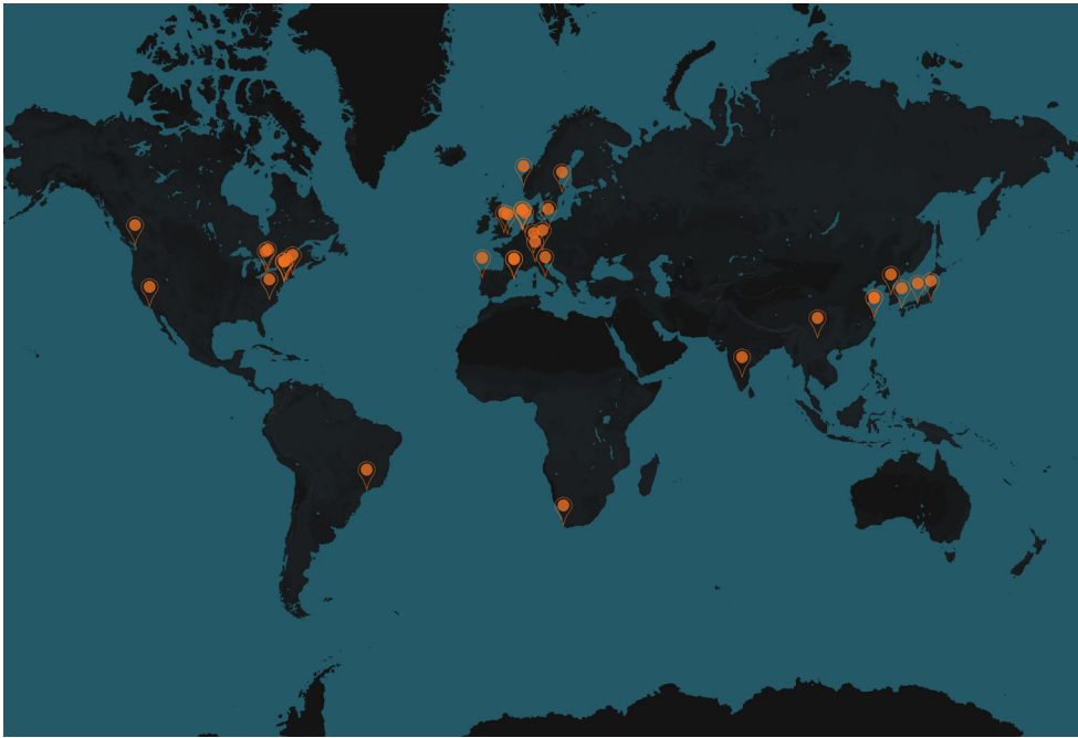
FIGURE 1 World map showing the 34 institutes participating in the ENIGMA-OCD consortium

cross-sectional structural MRI data a mega-analysis performs better than a meta-analysis (lower standard errors and narrower confidence intervals), and in a multi-center study with moderate variation between cohorts, a linear mixed-effects random-intercept mega-analytical framework seems to lead to the best model fit (Boedhoe et al., 2019).