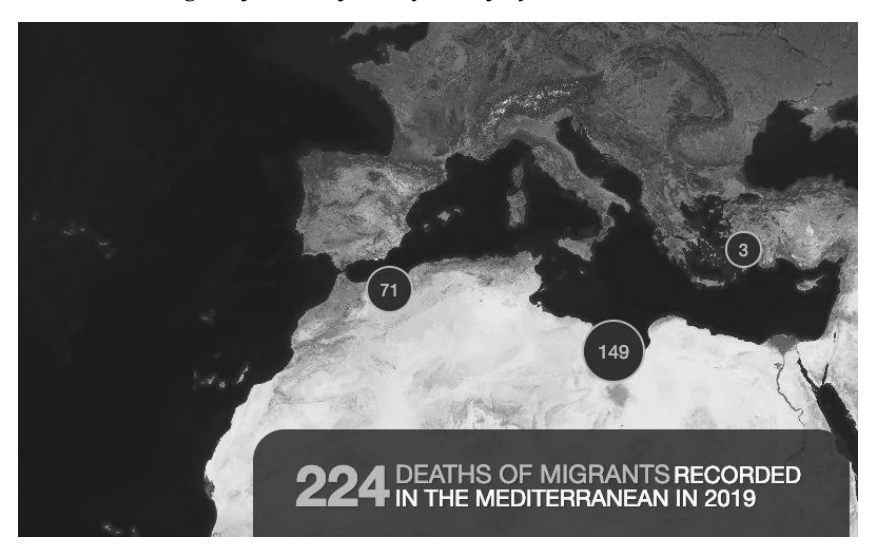
Source: IOM, 'Deaths by Route' (28 February 2019) https://missingmi-grants.iom.int/region/mediterranean?.

In particular, the impetus for the realisation of the HCs came following the death of at least 800 migrants of multiple nationalities (including Syri-