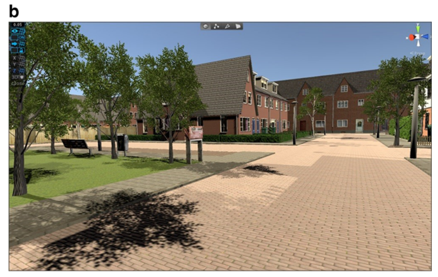
Fig. 2 a, b Impression of the virtual neighbourhood