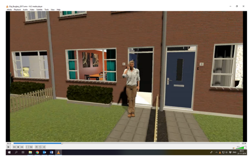
Fig. 3 Guardian in the virtual neighbourhood