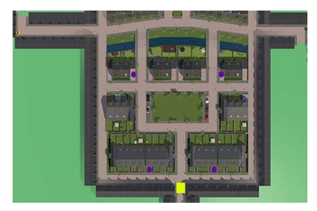
Fig. 1 Neighbourhood layout. The yellow square indicates the participant starting location; purple squares indicate the location where the guardian could appear