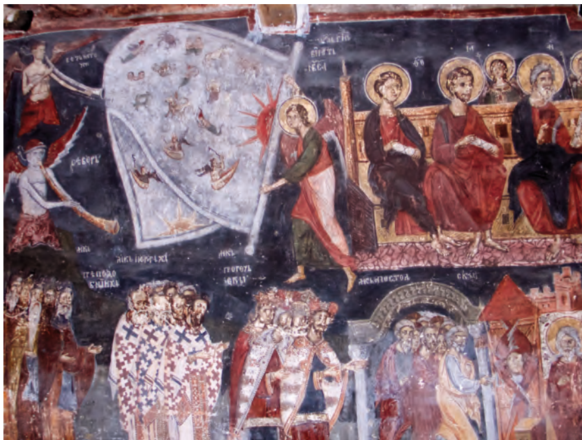
Figure 9.1: “The Angel of the Lord rolls up the skies”; fresco (1476) from the Dragalevtsi Monastery of the Holy Theotokos of Vitosha (Драгалевски манастир Света Богородица Витошка), Bulgaria. The fresco represents an iconographic rendition of the eschatological accounts in Isaiah 34: 4 (“And all the host of heaven shall be dissolved, and the heavens shall be rolled together as a scroll: and all their host shall fall down, as the leaf falleth off from the vine, and as a falling fig from the fig tree”) and The Apocalypse of John (The Book of Revelation) 6: 14 (“And the heavens departed as a scroll when it is rolled together”). Depicted on the scroll of heaven, rolled up in the hands of the angel, is the disappearing image of the Sun; next to the image of the Moon (at the bottom) is the winged Aphrodisia [Venus], depicted in a boat (alluding to her designation as a planet, i.e., as a “floating one”). Other winged luminaries (also in boats) are depicted to the left of the angel, next to the image of the Sun. The lower figure is difficult to identify, but the one above it is labelled as Ermis [Mercury]. Since the inscriptions are not clear, one can only guess that on the top edge of the scroll, to the right of the angel, are depicted (counterclockwise) Aries, Taurus, Gemini, Cancer; Virgo[?]; then below, clockwise, Scorpio, Sagittarius, Capricorn; below, Aquarius[?], Pisces, and Leo.