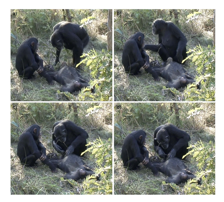
Figure 1. Tool use for corpse cleaning in chimpanzees. A female chimpanzee named Noel (a) approached Thomas' body, (b) turned sideways to select a hard piece of grass, (c) held the grass in her mouth while opening Thomas' mouth with both of her hands, and (d) cleaned Thomas' teeth using the grass.