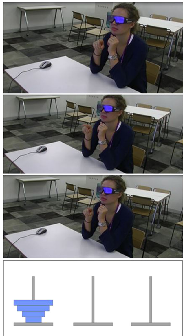
Fig. 1 Example of gesturing during the mental solving phase (1 s per frame). To show where participants look at during gesturing, the last frame is an example of the static Tower of Hanoi presented for 60 s during mental problem solving (inverted rules condition)

Gesture Participants' video data per task were coded for gesture frequency (for an example see Fig. 1). Due to camera malfunction, we could not count gestures of two participants. Gestures were defined as any hand movement of one or both hands from one still point to the next, indicating the travel of a disc from one peg to another (see Garber and Goldin-Meadow 2002). All participants used index-pointing gestures. The first two authors independently counted the gestures, and interrater reliability was high, Pearson's r = .89, p < .001 .