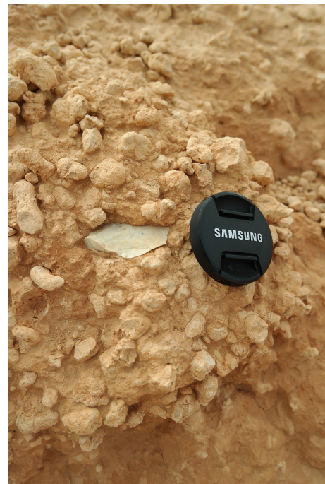
Figure 4. Stone artifact in its position found in TB-1 on a paleosol.

The original aim of the project was the reconstruction of paleoenvironmental conditions during loess sedimentation and soil formation phases. In this short communication, however, we focus on lithic artifacts found by chance during fieldwork. The chronology is still preliminary and allows only a rough temporal framework. However, our still-ongoing luminescence dating indicates that the lithic artifacts can be attributed to the marine isotope stage (MIS) 6 or older. Stone artifacts made of fine-grained flint (Fig. 3) were found on top of a paleosol in two locations (Fig. 4; for orientation see Fig. 2; TB-1 is 33.48162° N, 10.00782° E, and MT-02 is 33.51820° N, 9.99644° E). Combining both locations, the collection comprises 23 unretouched complete flakes larger than 2 cm, which are cortical, partially cortical and noncortical. We also found stone artifacts in a couple of other sections (20 complete flakes and flake fragments), albeit without exact stratigraphic context (the artifacts were washed out and transported downslope). The location of the artifacts found on paleosols is shown in Fig. 2. The age attribution has to