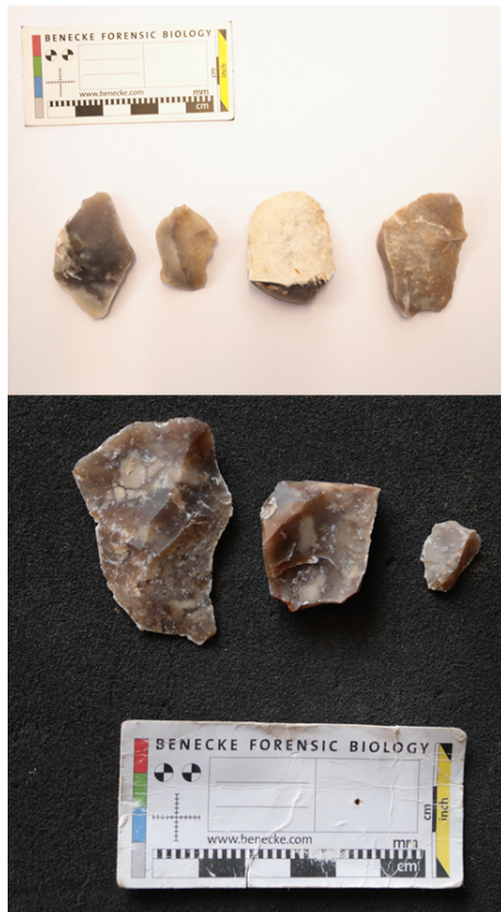
Figure 3. Selection of artifacts from the TB-1 profile.

stitute for Evolutionary Anthropology in Leipzig (Germany), the Université Bordeaux Montaigne (France) and the University of Freiburg (Germany).