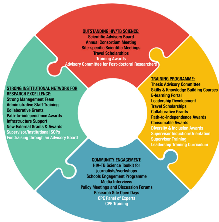
Fig. 1 Outline of key tools used in the SANTHE consortium to support scientific capacity building. Tools listed in black font were utilised in the first 5 years of our consortium. Highlighted in white font are new tools, identified through monitoring and evaluation efforts, that we feel would enhance our programme in the future. CPE = Community and Public Engagement. SOP = Standard Operating Procedures

scientific projects identified and led by African-based researchers, which in turn will lead to publications with African-based scientists as first and last authors and increasing numbers of grant applications with African-based scientists as principal investigators (PIs). Increased local grant funding, infrastructure development, and investment in training of science support staff will lead to the development of local research environments optimally supporting ongoing science and the scientists based therein. The foundation of an empowered cadre of local scientists, trainees and support staff will then lead to locally-driven CPE efforts that are dovetailed with relevant cultural and policy contexts applicable to African settings. This combination of a rich and growing pipeline of scientific expertise, research support and CPE activities will then lead to more efficient production of new knowledge and translation into policy and practice. Our current model acknowledges that sustained external funding support will initially be needed, providing time and stability to establish a functional and sustainable programme. External funding will need to be combined with scientific collaborative support from non-African based researchers and laboratories. However, over time increasing levels of African government and philanthropic financial support for research on the continent