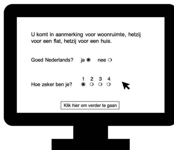
Fig. 1. Illustration of test interface. Participants had 20 s to answer both questions.

Written instructions at the start of the test included five example trials, with Ja/Nee responses completed as appropriate. Two of the examples were foils. The purpose of the example trials was to demonstrate that the question “Goed Nederlands?” entailed a grammaticality judgement, hence calling attention to the syntactic form of the sentences. Participants had the opportunity to seek clarification from the experimenter after reading the instructions. The test took approximately 30 min.