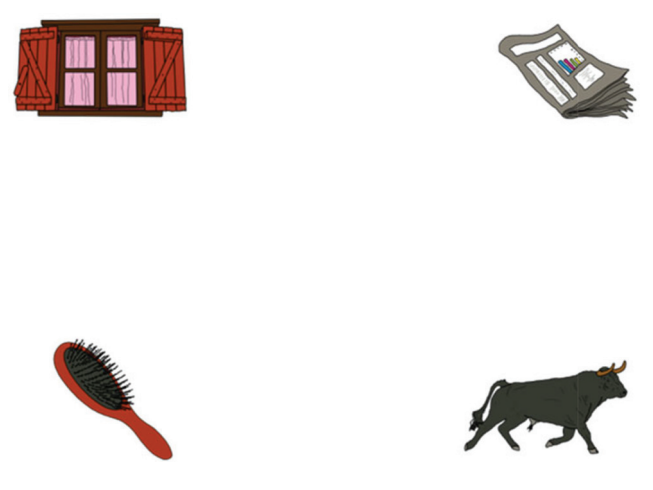
Note. Distractors were always inanimate objects, and none were plausible agents of the events described. There were no statistical differences in mean frequency of picture labels (Table 2) in the four sets of pictures (F = 0.09, p = .97). Picture positions were pseudorandomized such that patient and target entities appeared equally often in all four positions on the visual display. There was no repetition of pictures in the experiment. See the online article for the color version of this figure.

Example Visual Display for the (Passive) Spoken Sentence, "Het Raam Wordt Inderdaad Gebroken Door een Stier [The Window Is Indeed Broken by a Bull]," in Which "Stier" is the Target Picture