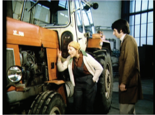
Figures 5-6. How we become aware of our hearts: 'Die Herznerven' [The Cardiac Nerves], Du und Deine Gesundheit , DFF, 1979 (©DHMD).

This becomes even more obvious if we turn to the protagonists of the film that again appear in a series of staged scenes. As in the first two film examples, the workplace is introduced as a space where health risks arise. However, in addition to this, there is a focus on private relationships. Since the late 1950s, medical experts had increasingly shifted their attention to the emotional structures of family life, following a similar ideological realignment among the socialist leadership. 25 In the workplace and at home, communication skills were seen as basic means for creating an egalitarian society, and shaping them properly was understood to be foundational for the formation of the socialist personality, both within and in relation to the collective. 26