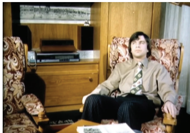
Video 4. 'Die Herznerven' [The Cardiac Nerves], Du und Deine Gesundheit , DFF, 1979.

As highlighted before, the management of emotions was considered key for maintaining functioning social relationships and preventing illness. The film 'Die Herznerven' pointed to the meaning of one particular emotion in this regard: trust.