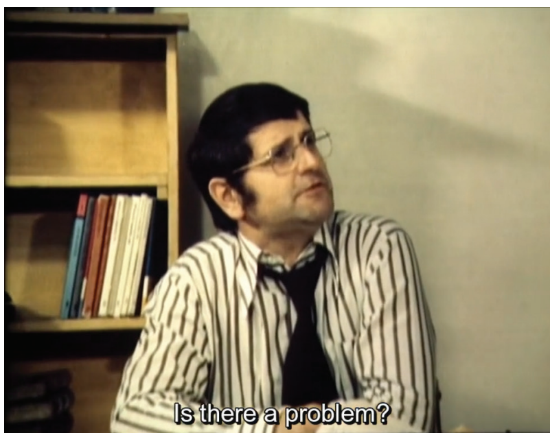
Video 1. 'Emotionen' [Emotions], Werbung auf Sender, DFF, 1981.

Take, for example, this excerpt from the programme below: