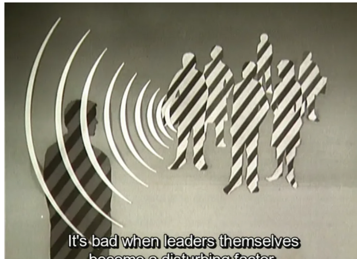
Video 2. 'Arbeitskollektiv' [Work Collective], Wegweiser Gesundheit , DFF, 1975.

Humans are depicted through a technical model of transmitter and receiver that situates them in a continuous feedback loop. Emotions are visualized as bad vibes that make the transmitter a “disturbing factor” in social interactions, and then trigger new bad vibes in return. “Every person giving off tension becomes a disturbing factor in interpersonal relationships. It’s bad when leaders themselves become a disturbing factor. It impairs mutually fruitful relationships between the leader and the collective”, the voiceover explains.