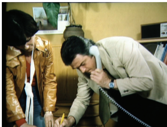
Figure 7. Overwork: 'Die Herznerven' [The Cardiac Nerves], Du und Deine Gesundheit , DFF, 1979.

The husband in the first excerpt of 'Die Herznerven' is not the only character suffering from distrust. The film also presents a second example of an unhealthy husband, a workaholic referred to as a "slogger" [Wühler] (Fig. 7). The man's negative emotions and behaviours are explained not only by his poorly organized work schedule, but also his failure to build trust, leading to isolation and overwork: "Everyone knows this type. Everything, really everything, he believes he has to do alone."