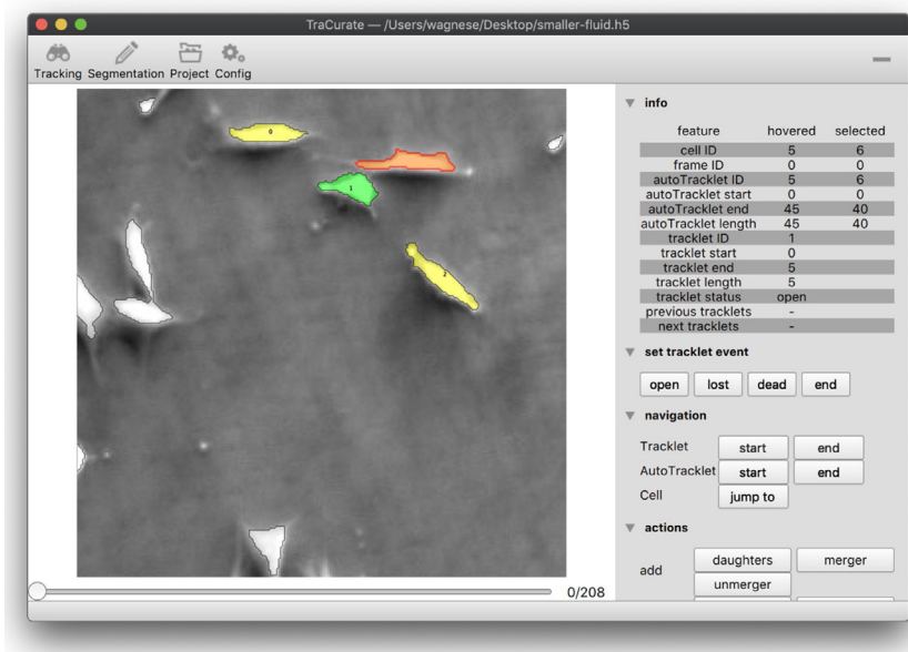
Fig. 2. Tracking view of TraCurate. The left panel shows the tracking area. The menu on the right displays information about selected objects and provides different tools for navigating, editing and annotating tracks.