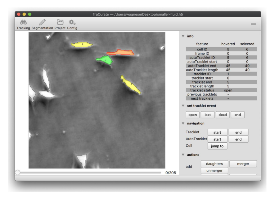
Fig. 2. Tracking view of TraCurate. The left panel shows the tracking area. The menu on the right displays information about selected objects and provides different tools for navigating, editing and annotating tracks.