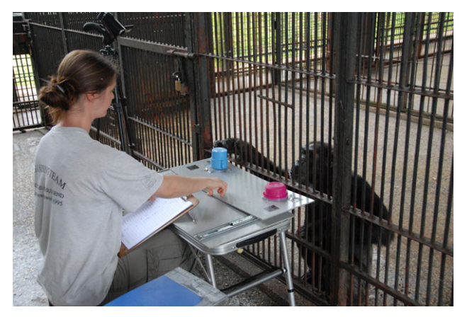
Figure 1. General setup with covered safe option (blue/tall cup) and risky option (pink/shallow cup). The centres of the two plastic lids on which the options were presented were 42 cm apart.

Chimpanzees were tested individually in their familiar sleeping rooms. The experimenter (E) presented two choice options hidden under two different cups on a table in front of the testing room (figure 1). The 'safe' option always held three pieces of apple; the 'risky' option either held six pieces of apple or none with a 50%