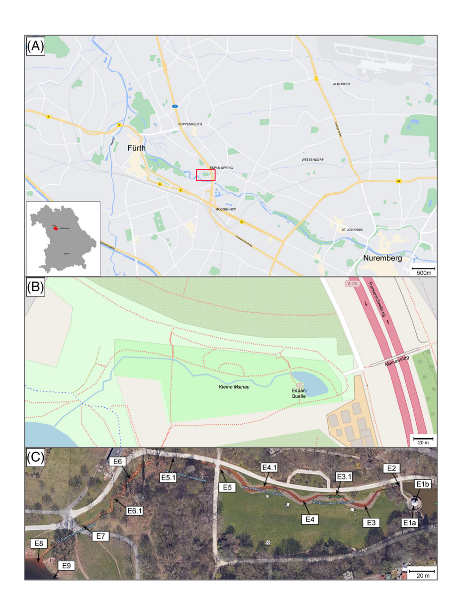
FIGURE 1 A, Location of the Espan spring in the metropolitan region Nuremberg Fürth. B, Overview map and C, satellite image of the Espan spring with sampling points