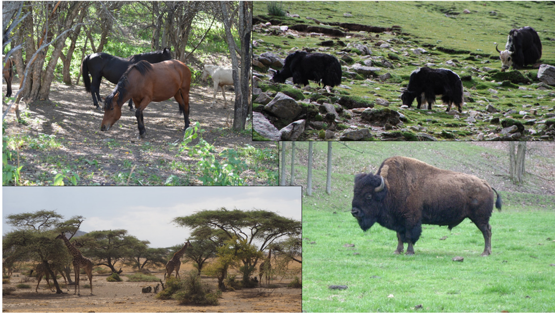
FIGURE 2 | From top left: (1) Photo of horses consuming wild apples in the Tien Shan apple forests of Kazakhstan, photo taken by Artur Stroscherer and Martin Stuchtey. (2) Yaks grazing in Tibet have significant ecological impacts, photo by lead author. (3) Giraffes near the Olduvai Camp in Tanzania browsing on Acacia trees, photo taken by Yiming Wang. (4) Bison in Missouri on a heavily grazed field of herbaceous annuals, most of which are well adapted to heavy herbivory and disturbed ecosystems, photo by lead author.

role that megafauna provided to many progenitors (Spengler and Mueller, 2019) ( Figure 2 ).