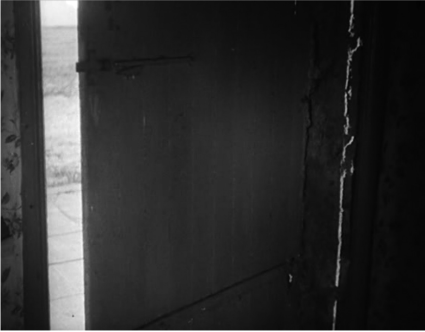
Figure 3.3 Jean Epstein, Le Tempestaire (0:02:32).