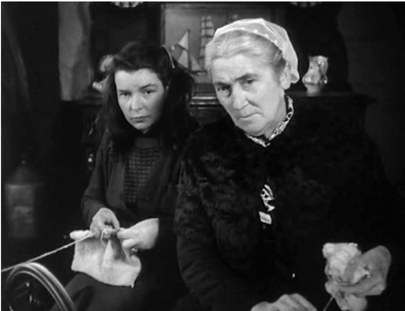
Figure 3.2 Jean Epstein, Le Tempestaire (0:02:28).