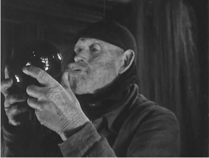
Figure 3.6 Jean Epstein, Le Tempestaire (0:19:14).

glass ball, the roaring surf is televised, and then superimposed with a long shot of the roaring sea coast. Four times in hard cuts, including missing half seconds, the image of the electronic tube cabinet from the lighthouse pops up in between. While the Tempestaire blows on the orb like a bony Zephyr, the filmed surf rewinds backward. Sea and rock separate, spray becomes wave. Finally, the storm calms down, the crystal ball shatters on the floor. Instantaneously, the fiancé appears at the open door, his dry scarf hanging limply. Last scene: the two humans of the future walking between sea, sky and land (Figure 3.7).