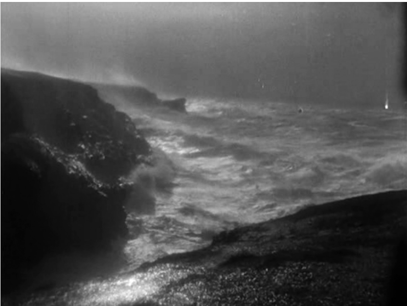
Figure 3.4 Jean Epstein, Le Tempestaire (0:09:54).