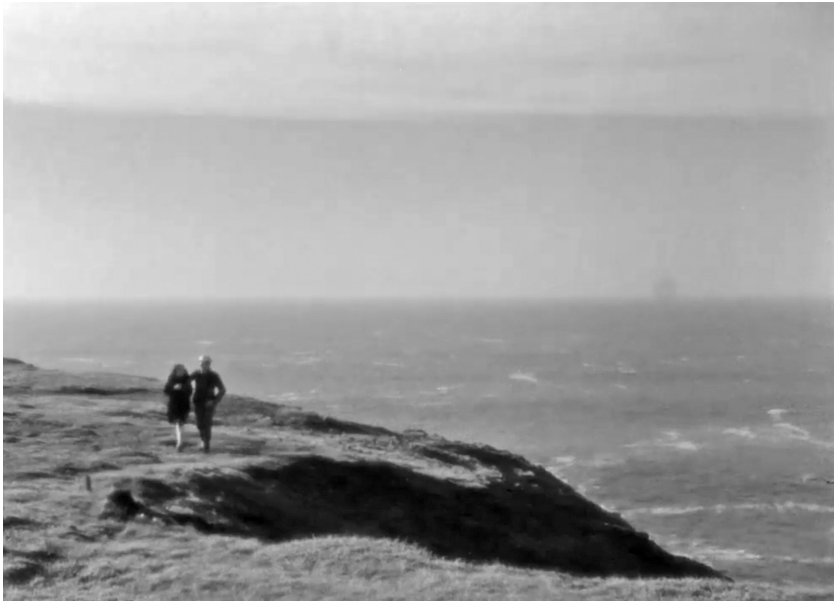
Figure 3.7 Jean Epstein, Le Tempestaire (0:21:27).