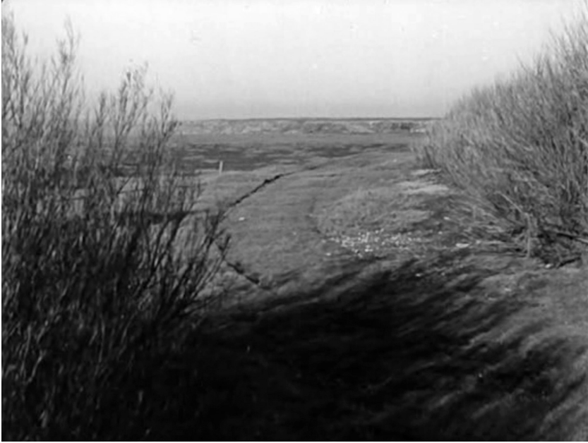
Figure 3.1 Jean Epstein, Le Tempestaire (0:01:21).