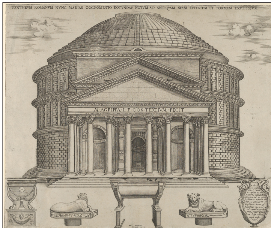
Figure 4: Anonymous, elevation of the Pantheon in Rome, reconstructed to its original form, engraving (Lafreri 1549).