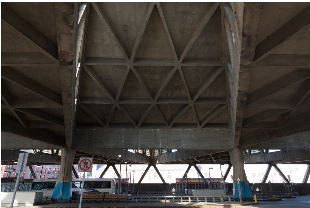
Figure 5: George Washington Bridge Bus Station, New York, designed by Pier Luigi Nervi (1961).

Roman classical architecture features again in the study of Marvin Trachtenberg, which interprets anew Louis Kahn's design for the New Yale Art Gallery (1951–53). Trachtenberg reads the project's huge, closed brick façade as a modernist interpretation of imperial architecture, harnessing, in spirit, the resilience of its formal characteristics and its symbolic associations. More provocatively, Trachtenberg argues that the ponderous Gallery façade was designed to appear physically defensive and resilient. As a visual 'Fire Wall' running along the edge of the Yale campus, Kahn's Gallery both guarded and separated the elite culture of the university from the city that surrounded it. In this case, the conceptual associations implicated in the idea of 'resilience' lead to a novel historiographical