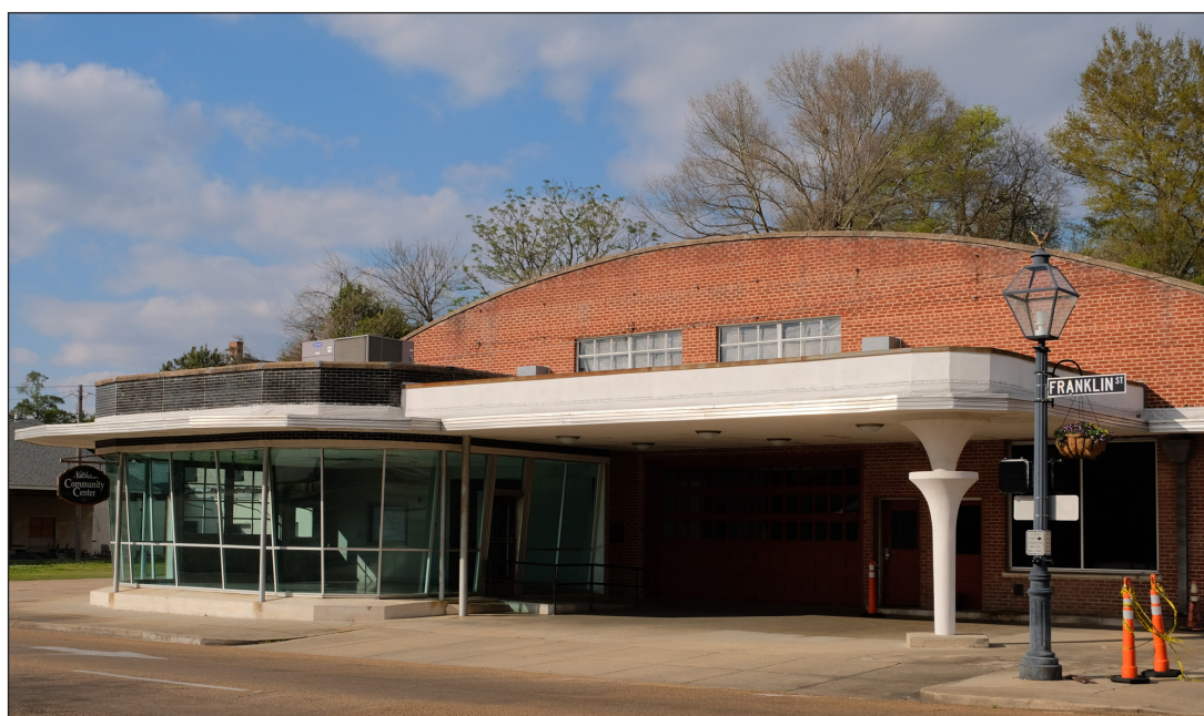
Figure 2: Former auto service station, repurposed as a community center, Natchez, Mississippi. In its physical form, the structure might be considered an example of American colonial architecture or resilient Palladianism. The building has also proven to be functionally resilient. Photo by Elizabeth Merrill, 2018.

historically embedded in the modes of production and perpetuation of this historical knowledge? Do such long-standing ideas need to be decolonized and challenged, or should they be further developed to incorporate other possible forms of historical knowledge production? Selective genealogies proposed by architectural historians might deconstruct and critique their subjects, or alternatively, reconstruct and vindicate them. And since such conclusions are not mutually exclusive, history can be limited neither to the vantage of a single assessor, nor according to its own past trajectory. Through changing cultural attitudes and interpretations, the course of history unfolds as a responsive continuum, within which architecture and the built environment play major roles (cf. Giedion 1967: 5–6). As elucidated by the articles of this Special Collection, the concept of ‘resilience’ in architectural history provides a lens through which to look back, to examine constructs that previously were largely ignored, such as the Roman thermal baths or the constructions of Bernhard Klemm in the German Democratic Republic. At the same time, it offers a framework with which to reconsider oft-studied figures, concepts and structures – Pier Luigi Nervi, Louis Kahn and museum architecture, among others.