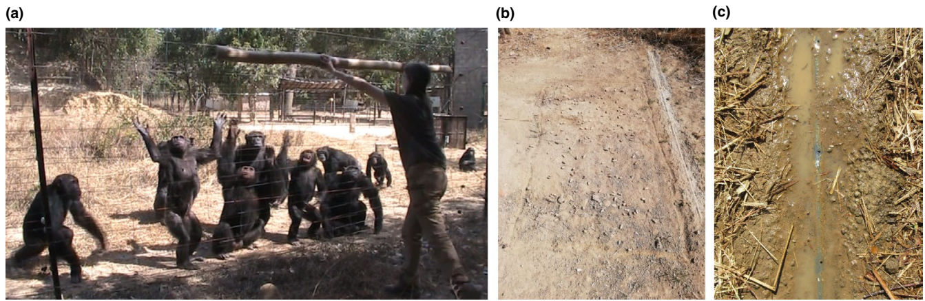
FIGURE 1 Depicted are still frames of (a) the peanut swing, (b) the peanut plot and (c) the juice pipe assay [Colour figure can be viewed at wileyonlinelibrary.com ]

of experimental tests, most prominently the co-feeding measures (peanut swing and juice pipe experiment) in recent years. More details on the group compositions including genetic background at the level of sub-species can be found in Table 1.