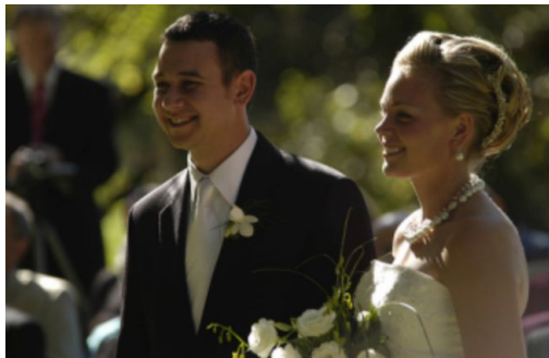
Hypothesis: A man and woman inside a church. Textual premise: A man and woman getting married. Original label: Neutral Caption #2: A man and woman that is holding flowers smile in the sunlight. Caption #4: A happy couple enjoying their open air wedding.