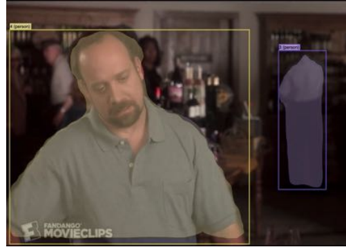
Question: What would happen if 3 were to give 4 a bottle of wine? Answer: 4 would drink the wine until he was drunk. GT Explanation: 4 is sad and people tend to drink excessively when they are sad and drinking excessively leads to becoming drunk , there for 4 would drink until he was drunk.