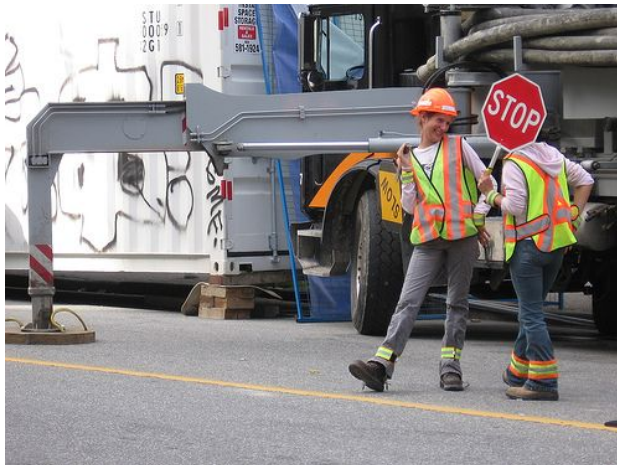
Hypothesis: The people are flying kites at the beach. Answer: Contradiction RVT: People can't be riding kites while they are flying kites. PJ-X: People cannot be flying and flying at the same time. FME: People cannot be walking and flying kites at the same time e-UG: People cannot be flying kites while they are standing on a street. GT Explanation: construction site is different from the beach