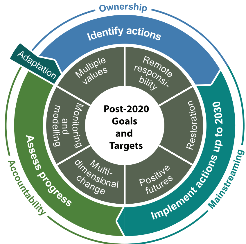
FIGURE 1 Scientific advances of the past 10 years inform a framework for implementation of the post-2020 goals and targets. The framework promotes ownership and mainstreaming, accountability and monitoring of biodiversity and is applicable across sectors and spatial scales

Although the proposed Target 21 (Table 1) recognizes the importance of equitable participation of local communities in decision-making, we argue that recognizing and fostering these different values systems needs to underpin the translation and implementation of the entire post-2020 set of goals and targets. This would increase acceptance, own-